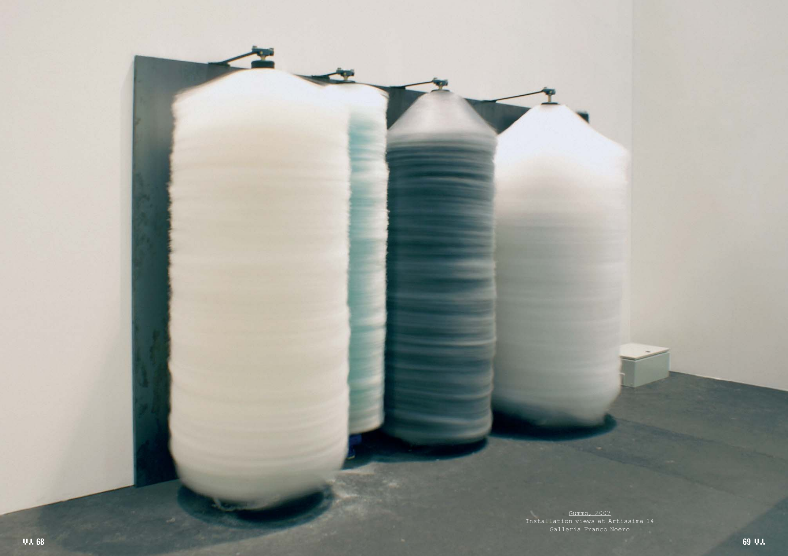
Gummo, 2007 Installation views at Artissima 14 Galleria Franco Noero