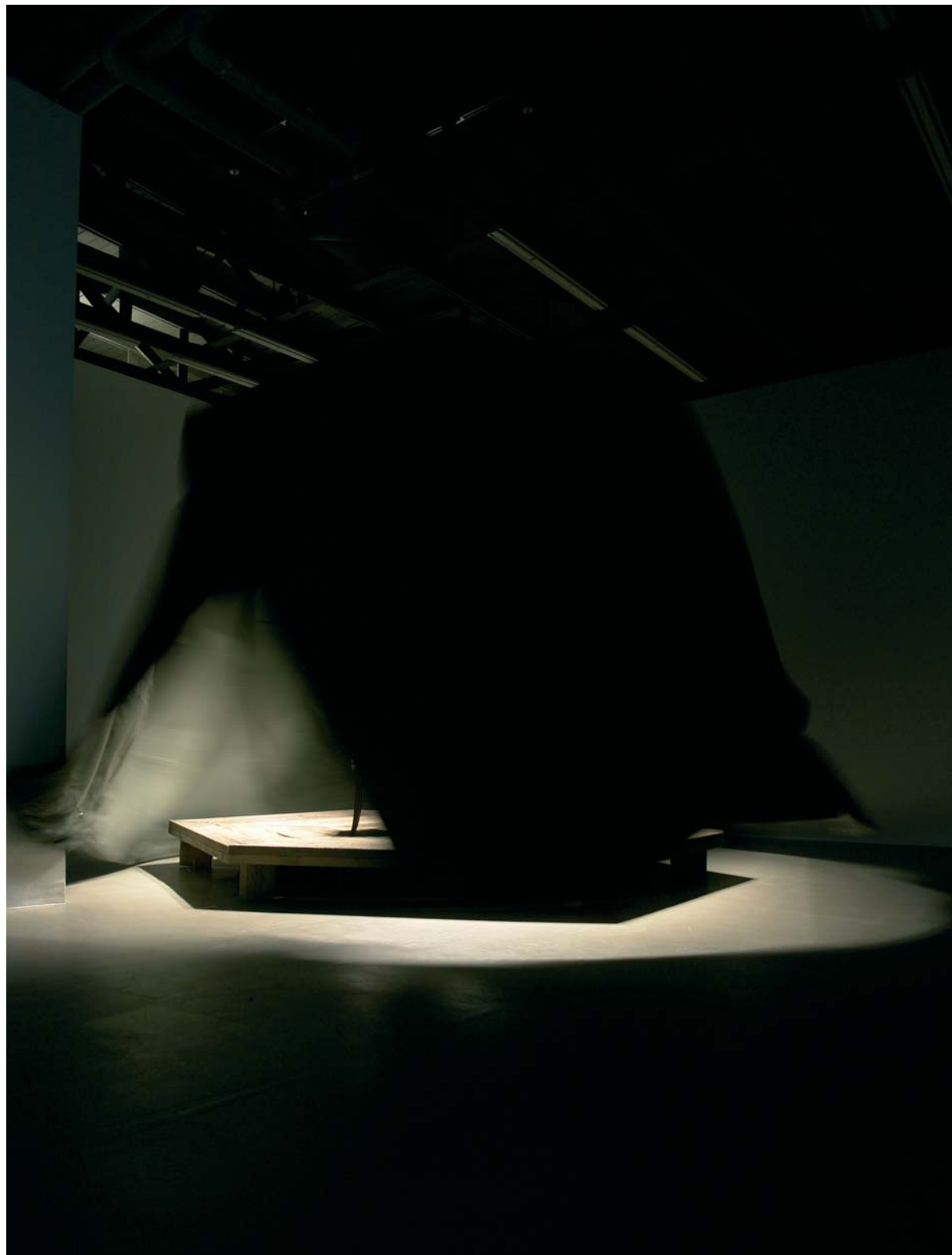
Cominciò ch'era Finita (it began while it was already over), 2006 installation views at Klosterfelde Galerie, Berlin, 2006