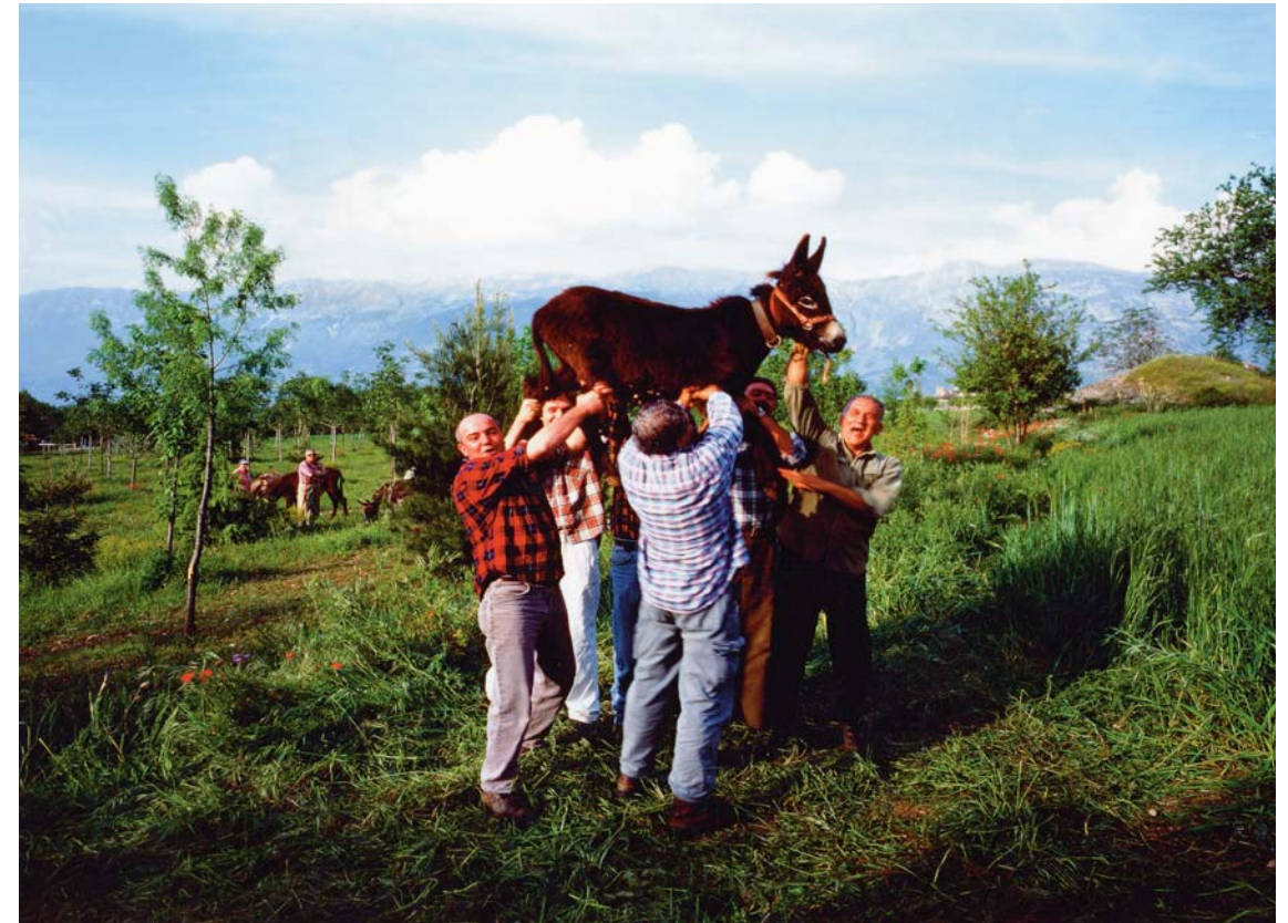
Mondo alla rovescia(The Upside-down World), 2002

LF : Very Few! After an official inspection by the Royal Staff everything would have followed the Royal Protocol. My work stopped before that, with the very possibility to project an apparition, a 'platonic' intervention, a Goliardic visualization, or a confrontation with the appearance of a movie star from early cinema. It was an objectless hallucination, a kind of sentimental investigation that was projected to appear yet be autonomous in denying itself. The failure was long-awaited and foreseeable, and was highlighted at the fair by the sound of applause, that put an end to the great daily spectacle as everyone was heading for the exit.