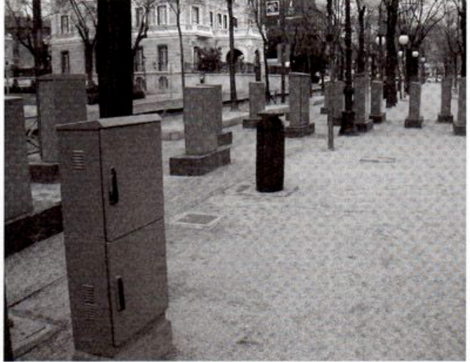
Tercerunquinto, Untitled , Madrid Arco 2005

In Project for MUCA Roma , (2004) [a venue managed by the Universidad Nacional Autónoma de México [UNAM]], their work took on a clearer social dimension through the direct cooperation of the local community. For two months the gallery space was transformed into a fence-and-lock-protected warehouse where local black-market traders were invited to store their goods. Tercerunquinto's input into the space was almost non-existent; all their energies went towards acting as mediators between the cultural administration of the venue and the informal merchants, fostering mutual trust from understandable suspicion. The merchants were given identity passes allowing them access to pick up their goods, and the lawyers representing UNAM drew up contracts to protect the 'illegal' status of the merchants' activities. In the brightly lit galleries, visitors could see the variety of materials that were stored in the space through the windows of the building, which included copies of old master paintings piled with easels, clothes, furniture and an archive containing copies of the legal agreements. Testing the role of art institutions as a public service, this project provided an operational safe haven for a parallel economy that is usually out of sight or out of mind.