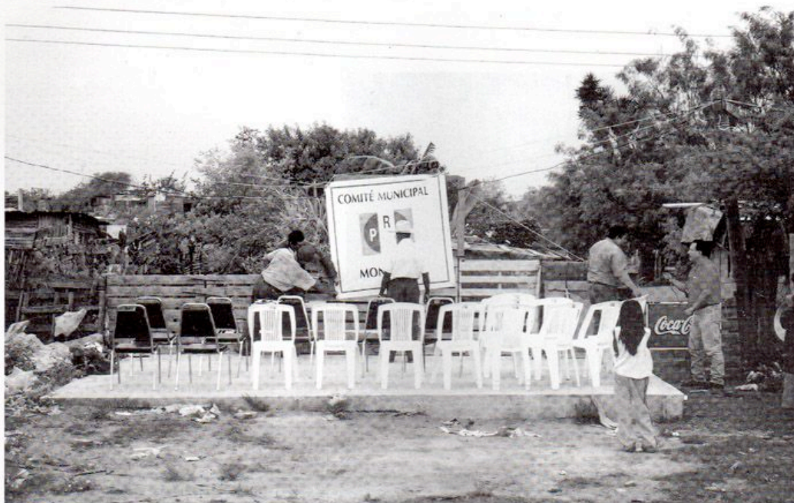
Tercerunquinto, Project for a public sculpture in the outskirts of Monterrey , [2003], Mexico