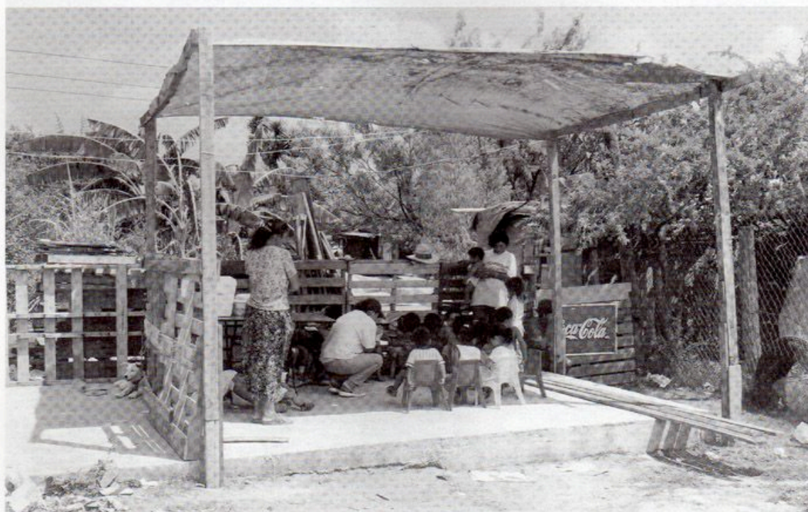
Tercerunquinto, Project for a public sculpture in the outskirts of Monterrey , [2003], Mexico